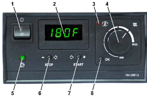
Picture 1. Front of the device

Basic operation of the device is done by setting desired temperature with boiler thermostat knob, other functions are realized according to parameters programmed in service mode. While changing boiler temperature settings with the knob, the change is displayed on the display for a few seconds (for example [C180]) and this value means the temperature, which the controller will be trying to achieve. You can check this value by pressing OK button. After pressing START button, the fan starts to work and the control process begins. STOP button stops the fan, for example allowing to add fuel to the boiler.